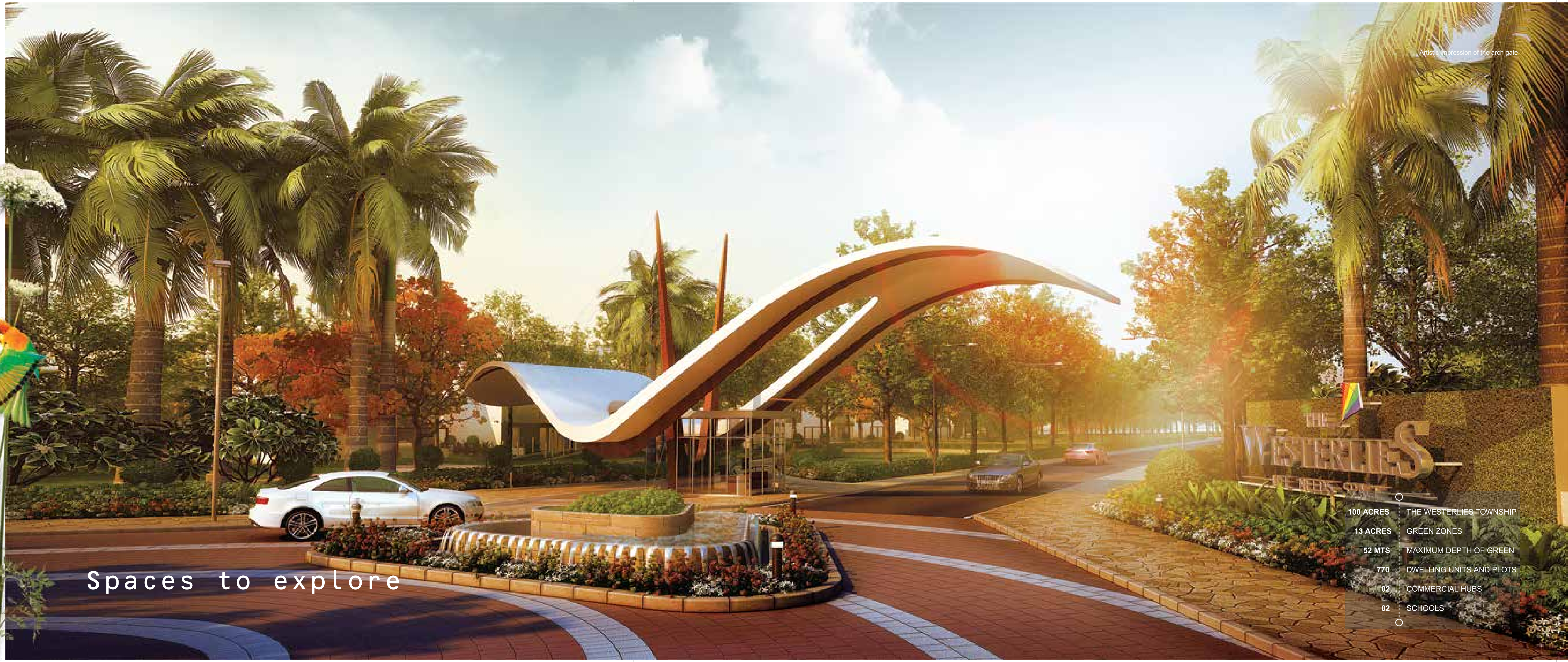
Artistic impression of the arch gate